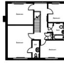
Existing First Floor Plan 1:100