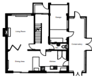
Existing Ground Floor Plan 1:100